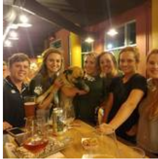
From FaceBook post.

Thank you to our family, friends, and fans who joined us at The Whale last night! And a HUGE thanks to the staff at @thewhalegvl and @residentdogsgvl for keeping thirsts quenched and bellies full.